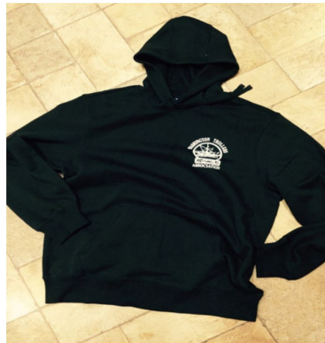
Left: Heavy Weight Hooded Sweatshirt (black), $50 each.